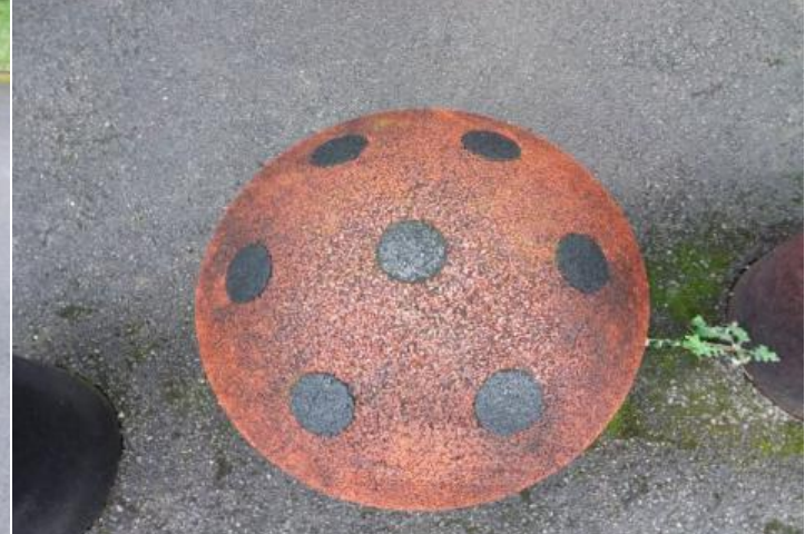
Finding: There is algae or moss on the surface of the equipment