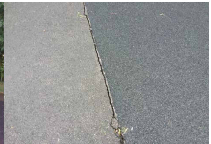
Finding: There are gaps opening between the surfacing and Action: Monitor for any further deterioration and repair as the edging surround or between the joints in the surfacing required