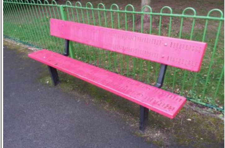
Finding: There is algae or moss growth on the surface resulting in slippery conditions

Ancillary Items - Bench Risk Level: L - Low Risk Item: Manufacturer: Owner/Operator Surface: Bitmac