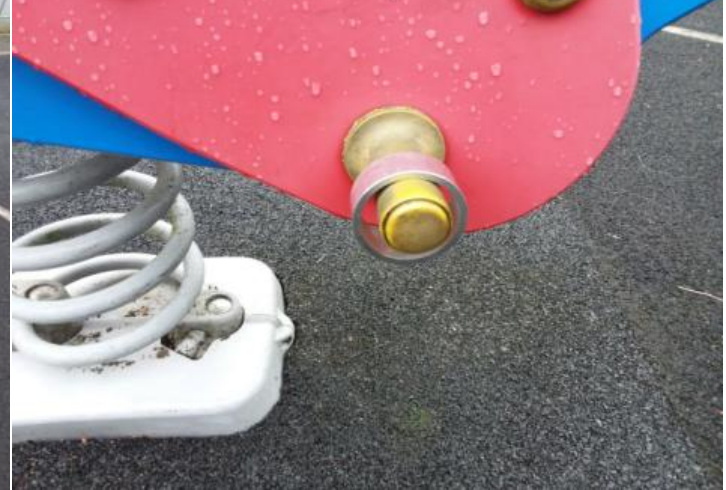
Finding: The end of handgrips and/or footrests have a cross Action: Monitor - No remedial work recommended section of less than 15cm2 and fail to meet the requirements of BS EN 1176 Part 6; this is however, a relatively low risk failure and no remedial action is recommended