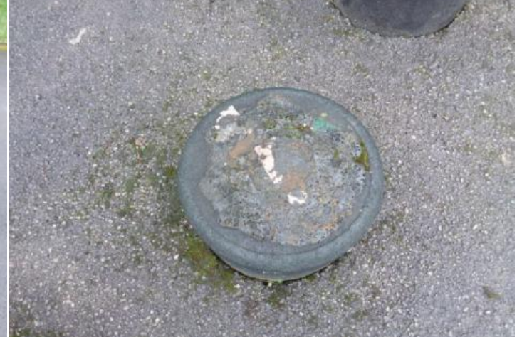
Finding: There is some evidence of fire damage to the item Action: Replace or repair as required