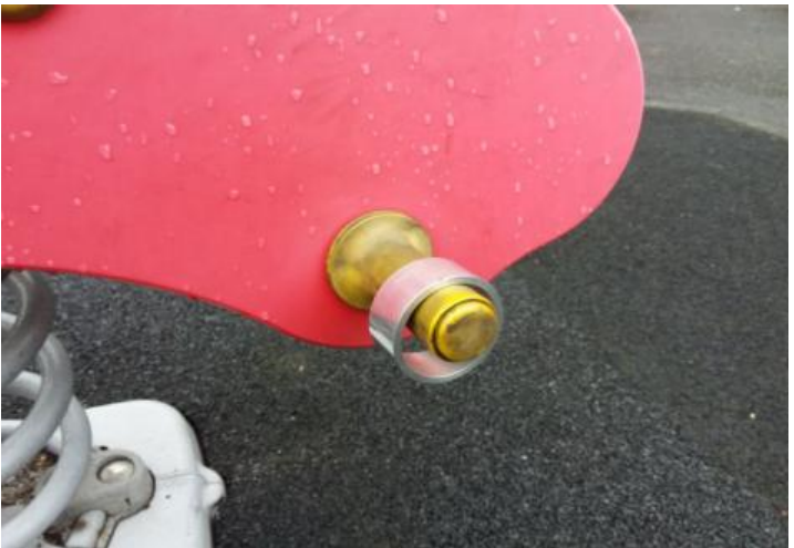
Finding: The end of handgrips and/or footrests have a cross Action: Monitor - No remedial work recommended section of less than 15cm2 and fail to meet the requirements of BS EN 1176 Part 6; this is however, a relatively low risk failure and no remedial action is recommended