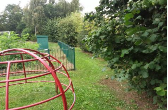
Finding: The tree canopy overhangs the equipment and is less than 2.0m away