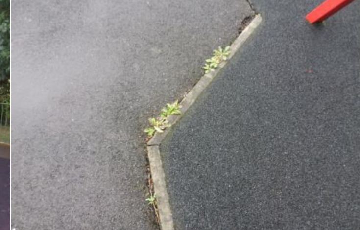
Finding: There are weeds/vegetation growth between or around the edges of the surfacing