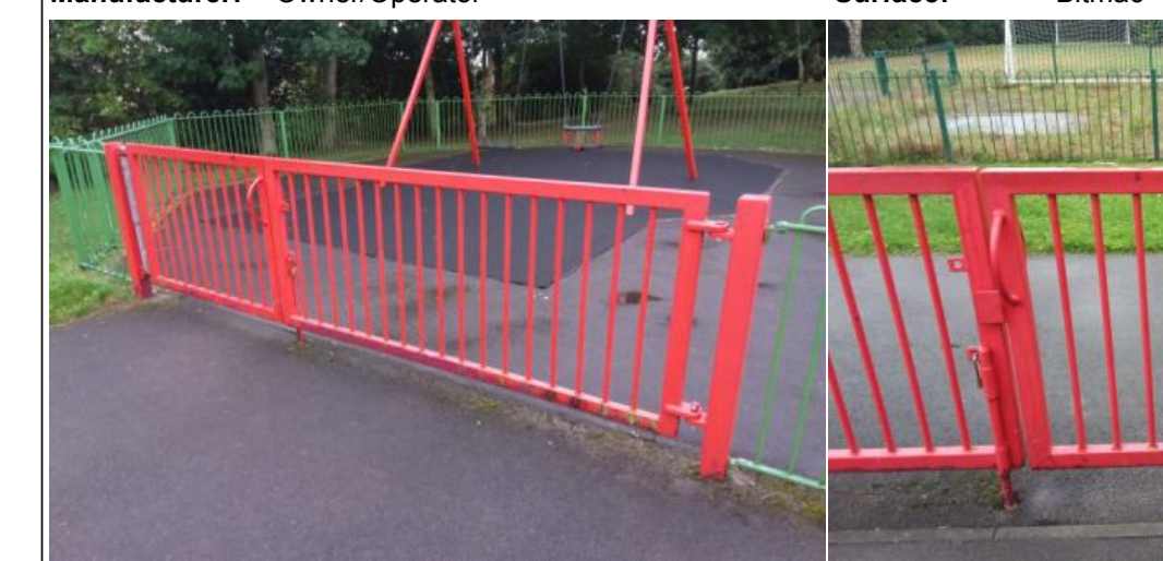
Finding: The gate is closing too quickly (less than 4 seconds)

Item:Ancillary Items - Gate - CombinationRisk Level:L - Low RiskManufacturer:Owner/OperatorSurface:Bitmac