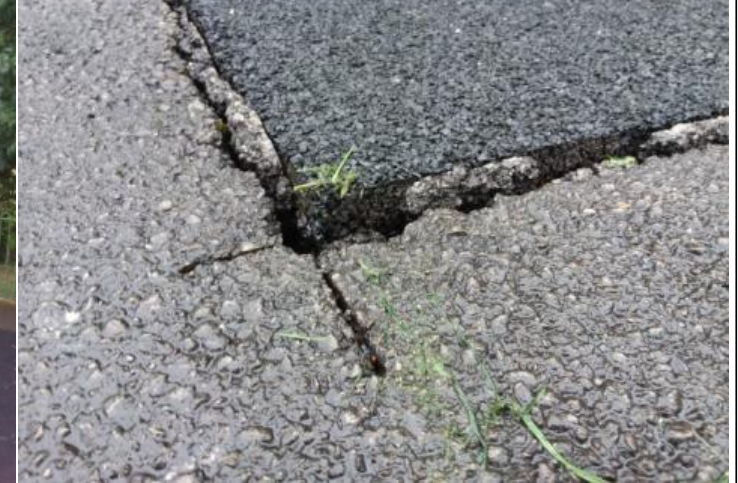
Finding: The surface is lifting at the edges and creating trip Action: Repair perimeter of surfacing to remove trip points points