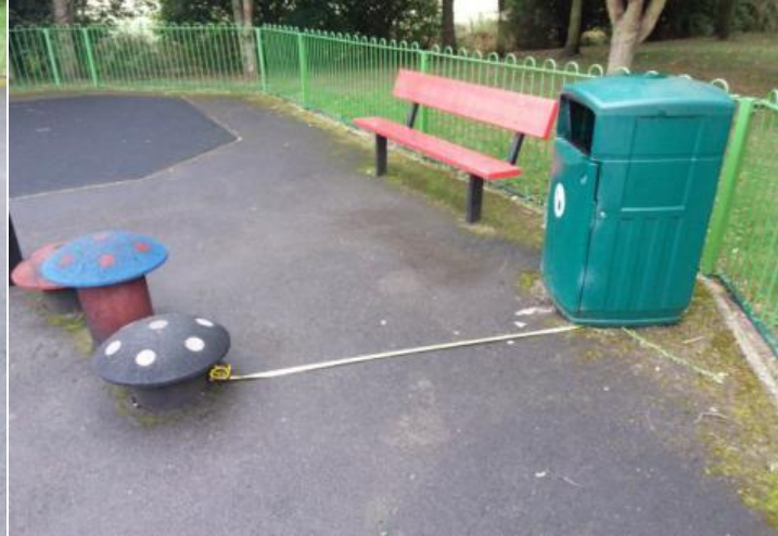
Finding: The bin forms a hard object within the falling space Action: Monitor - No remedial work recommended of the equipment in contravention of the requirements of BS EN 1176 Part 1